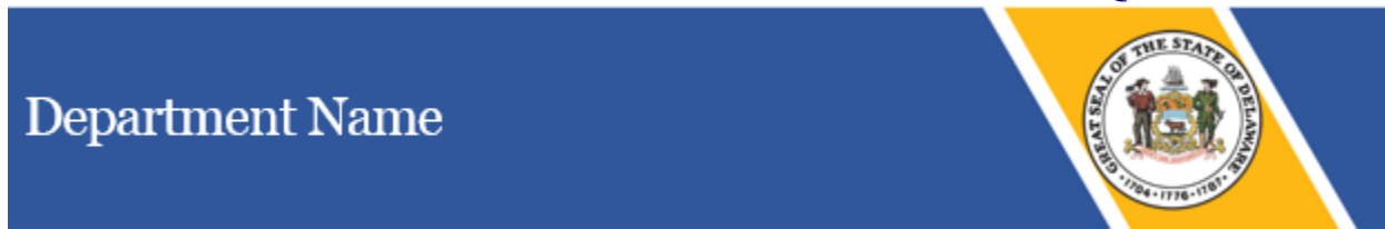
EXHIBIT C CAPITAL REQUEST - TAB 1