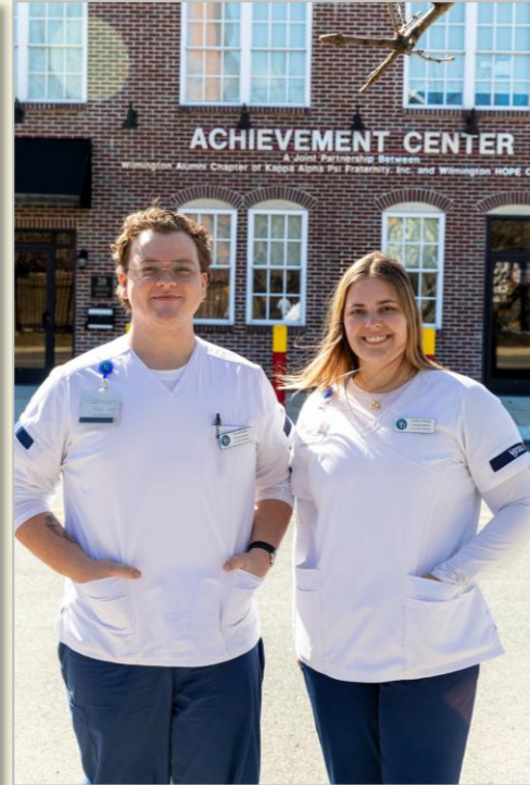
Growing the healthcare workforce