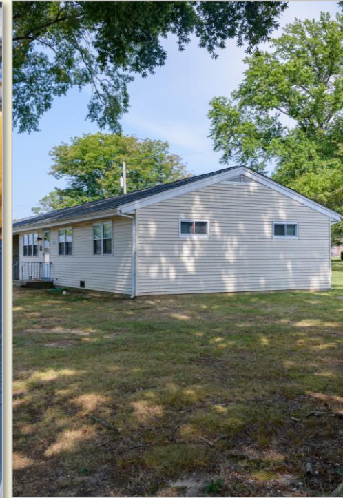
Building student and workforce housing, classrooms and convening spaces