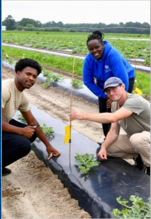
Ensuring access to education