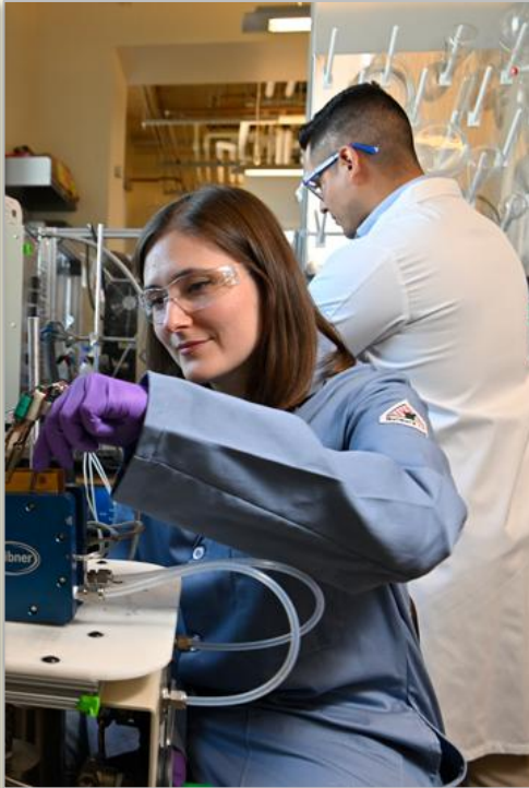
Investing in research and learning