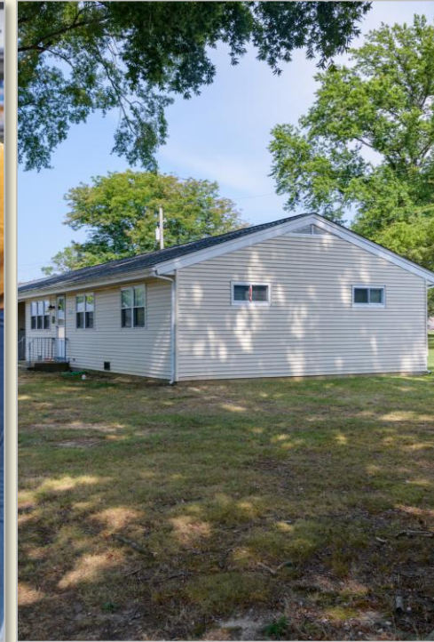
Building student and workforce housing, classrooms and convening spaces