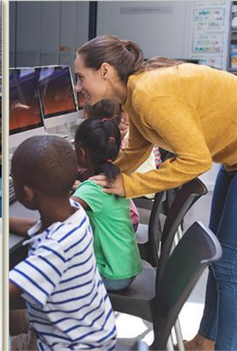
Training more teachers